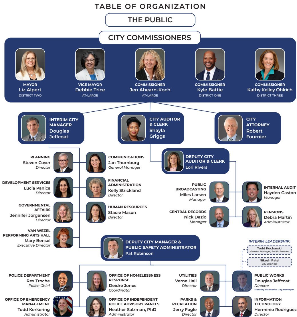
FIGURE 2: SARASOTA ORGANIZATIONAL CHART

The City of Sarasota utilizes a Commission-Manager form of government. The City Commission is comprised of five Commissioners, two are at-large and three from single-member districts. Elections are staggered and held in November during even-numbered years. District seat elections were just held in November 2024, whereas at-large seat elections will be held in November 2026. Terms are for four years, with no limits. Currently, one Commissioner has been newly elected, another is two years into serving their first term, and the remaining three Commissioners have served one term or more.