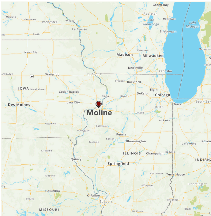
Figure 1: Location of Moline, IL

minute snowstorms, and floods (due to the city’s proximity to the Mississippi River). Fall is generally mild and comfortable.