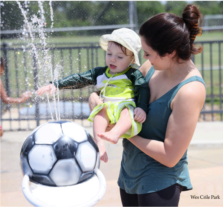
Wes Crile Park