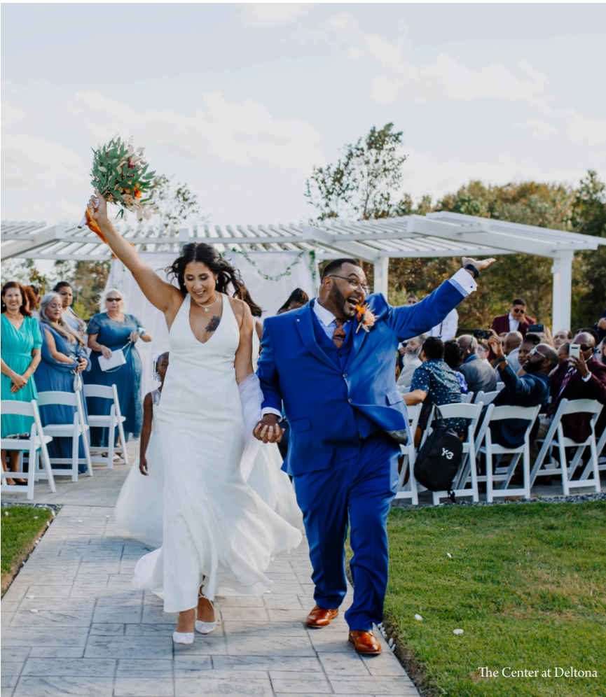
The Center at Deltona

consultation on City insurance matters; performing all duties and functions imposed by general and special laws upon city attorneys; and preparing / reviewing / approving deeds, and other legal instruments affecting or pertaining to the City or in which the City is a party. The individual will also monitor the performance of any duties where matters are assigned to outside counsel. Finally, the City Attorney monitors and supervises outside attorneys hired on specific matters and works with the City's Insurance Carrier on defending against third party tort actions.